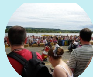
Wheelie Bin Race