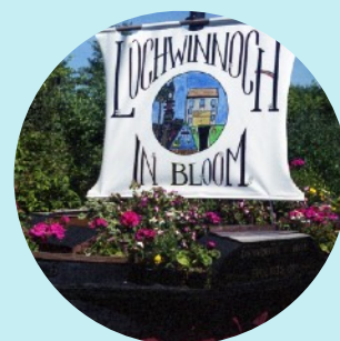
At NEWTON of BARR