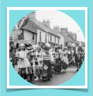
Fancy Dress Parade Circa 1950