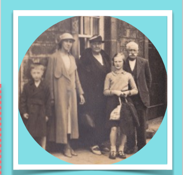
The 3 photos above contributed by